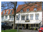
Hotel die Port van Cleve *** (Enkhuizen) www.deportvancleve.nl